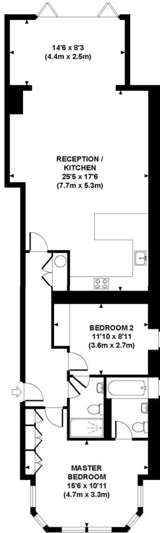
LOWER GROUND FLOOR GROSS INTERNAL FLOOR AREA 982 SQ FT

Although every attempt has been made to ensure accuracy, all measurements are approximate. The floor plan's for illustrative purposes only and not to scale. Measured in accordance to RICS standards. DE-PHOTOGRAPHY.NET