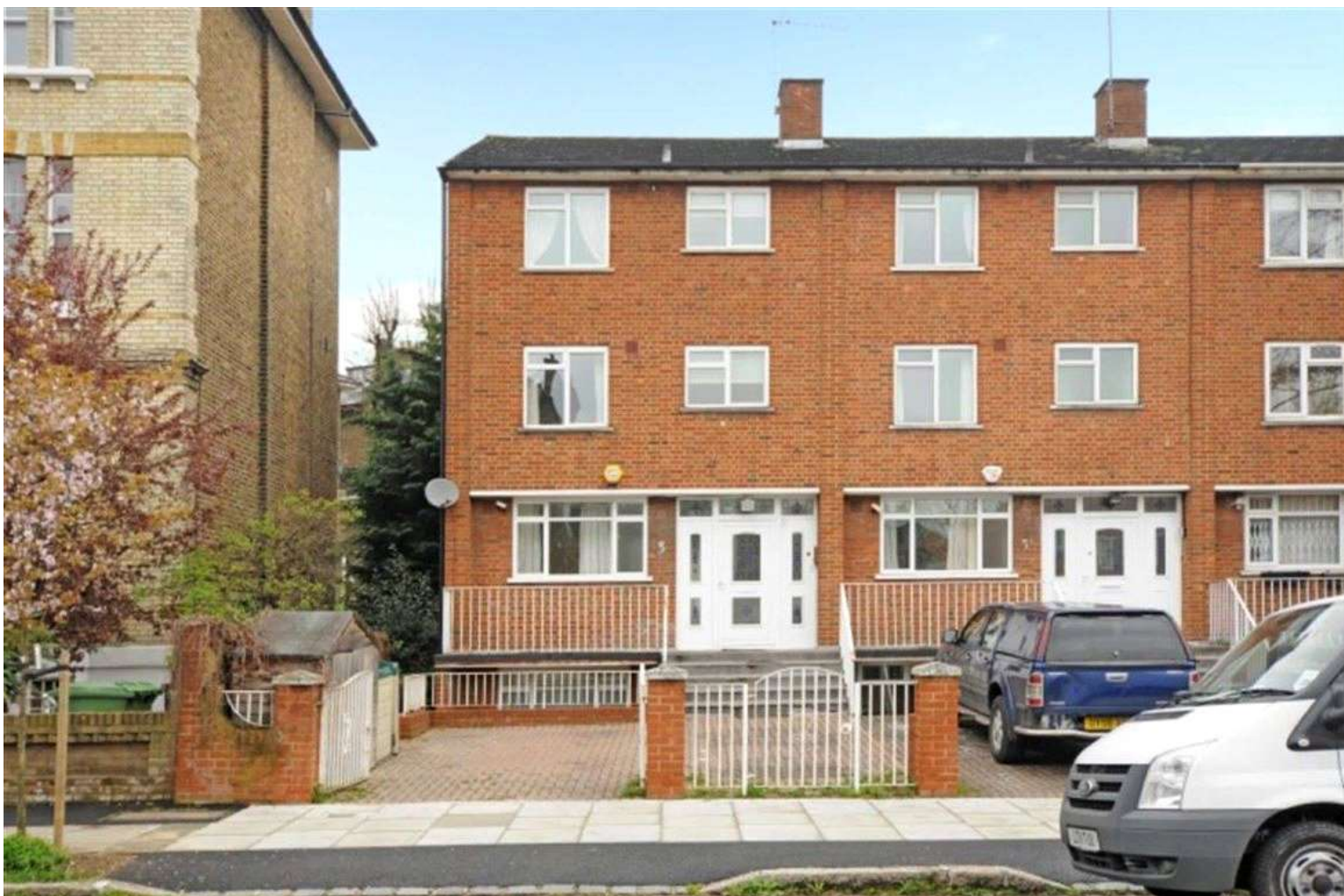
108 Fortune Green Road, West Hampstead, London, NW6 1DS